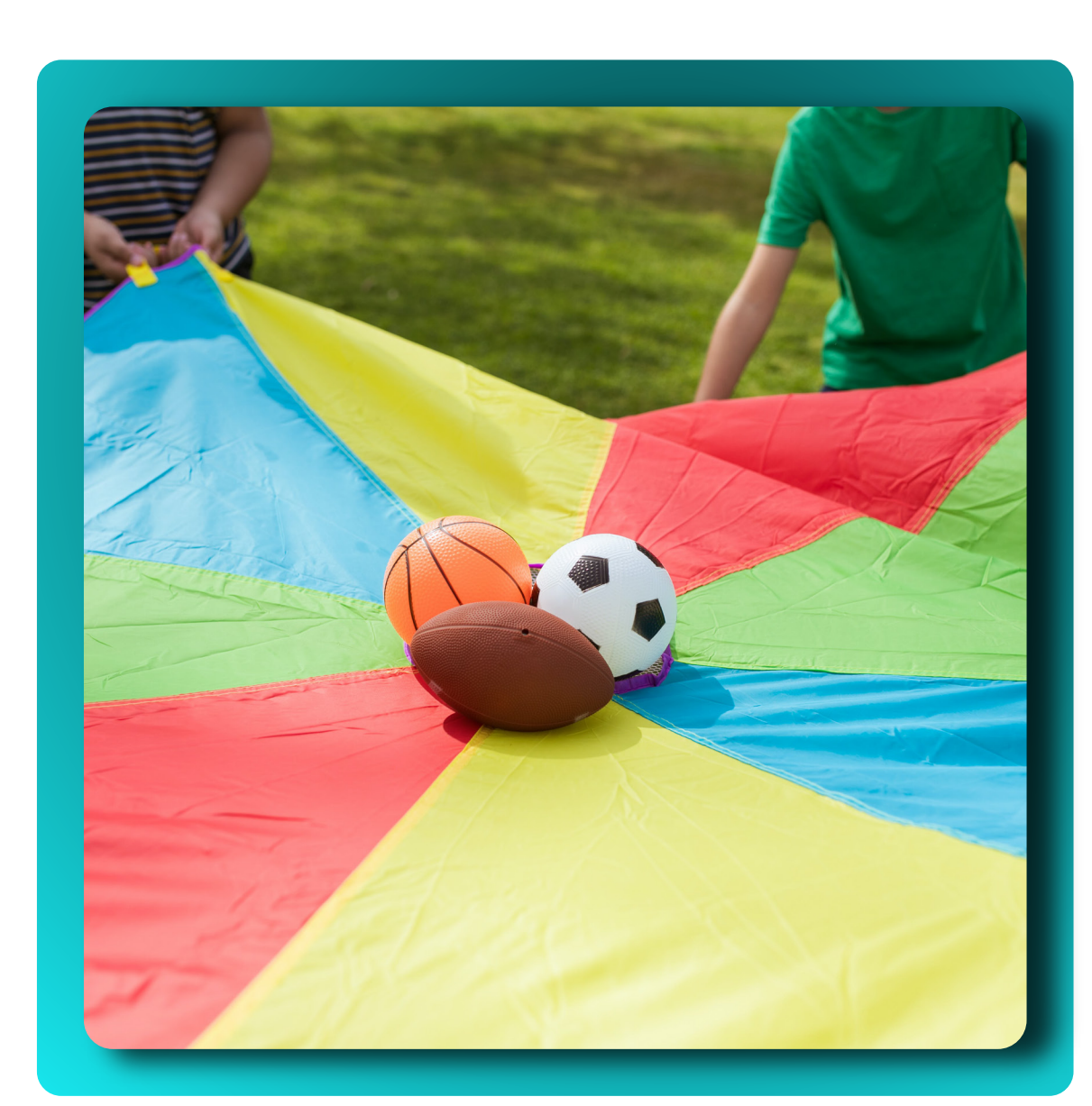
Play Therapy & Integrative Therapy,